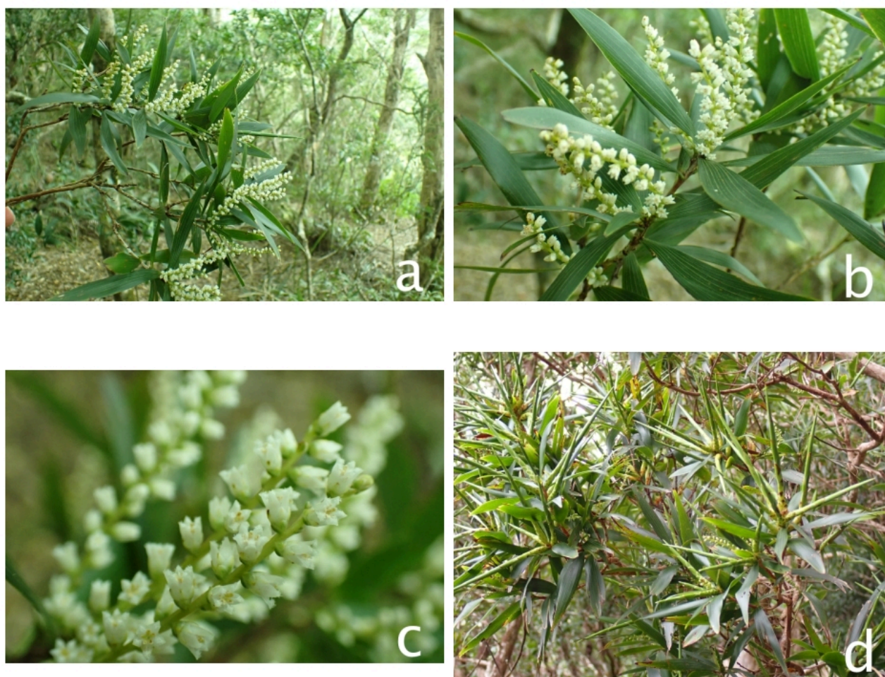
Figure 3. Leucopogon excelsus a, b, flowering branches; c, inflorescence; d, spear-like vegetative shoots.

JJH1110 (BRI); Mount Merino, 10 Sep 2005, G. Leiper 6 (BRI); Valley of Echoes, Lamington, 1 Nov 1999, G. Leiper s.n.(BRI, AQ668179); Lamington Plateau, track from 'Moonlight Crag', near Lyrebird Lookout, 1 May 1994, G. Leiper s.n.(BRI, AQ627908). New South Wales. Durigan Lookout, Limpinwood Nature Reserve, 28° 18'S 153° 11'E, 22 Jun 1977, A.G. Floyd 468 (NSW); Summit Mtn, Gibraltar Range N.P., E of Glen Innes, 8 Sep 2000, A.R. Bean 16845 (BRI); Gibraltar Range N.P., on summit of peak above tick gate, 12 Sep 1970, C. Bell 63 (BRI); 4.5 km N of Blackbutts Lookout in Border Ranges National Forest, undated, A. May s.n. (BRI); 2.6 km S of The Pinnacle carpark in Border Ranges N.P., along Tweed Range Scenic Drive on eastern side of road, undated, A. May s.n. (BRI); Tweed Range scenic drive, head of Warrazambil Ck, up on escarpment edge, 28° 25' 28"S 153° 07' 34"E, 5 Sep 2002, D.M. Crayn 439 et al. (BRI, NSW).