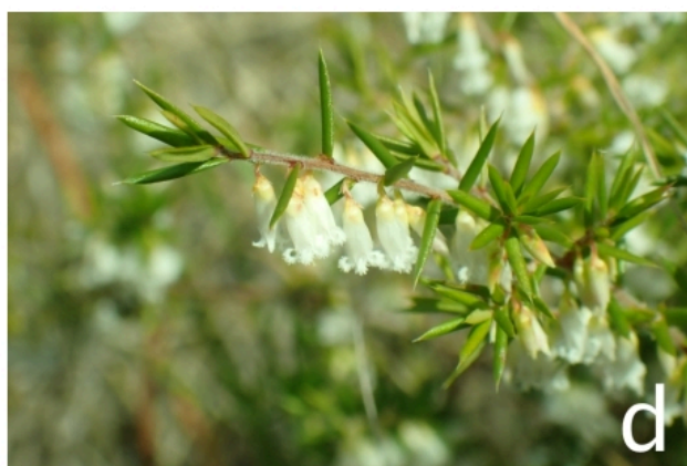
Figure 4. Styphelia oxyphylla a, habit; b–d, flowering branches.