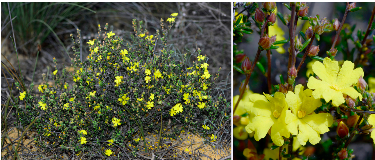
Figure 3. Hibbertia elachophylla , K.R. Thiele 5697.

Road and Narkal Road, along the track parallel to the rail line, 19 Aug. 2021, K.R. Thiele 5697 ( holo : PERTH 9428119; iso : AD, CANB, MEL).