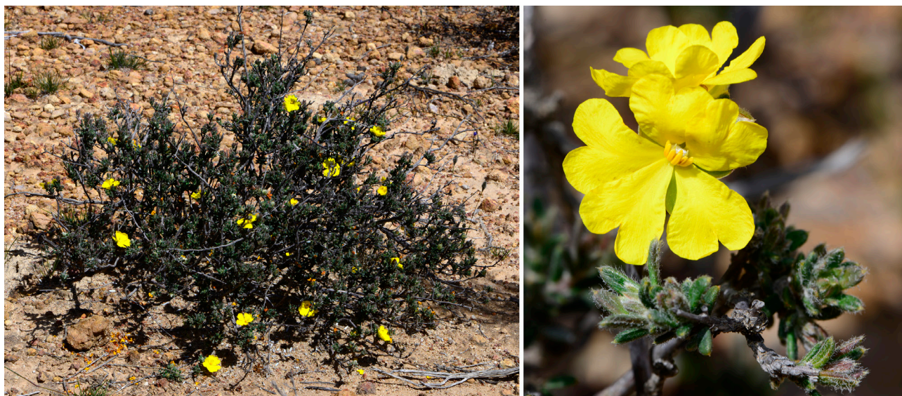
Figure 2. Hibbertia erioclada , K.R.Thiele 5757.