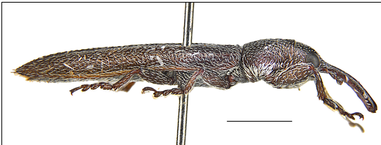
Figure 2. Stenobelus minutus , sp.nov. holotype, lateral image. Scale bar 1 mm.