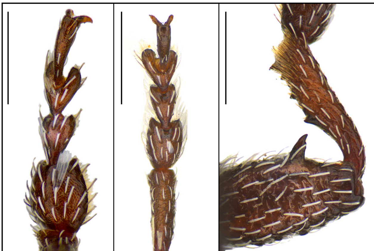
Figure 3. Stenobelus minutus , sp.nov. holotype. Dorsal images of the foretarsus (left panel), mesotarsus (centre panel), and spination of the foreleg (right panel). Scale bars 0.25 mm.