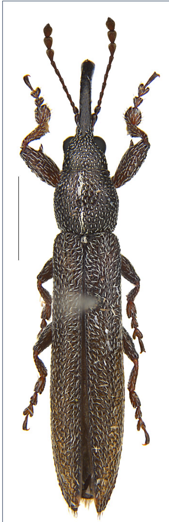
Figure 1. Stenobelus minutus sp. nov., holotype, dorsal image. Scale bar 1 mm.